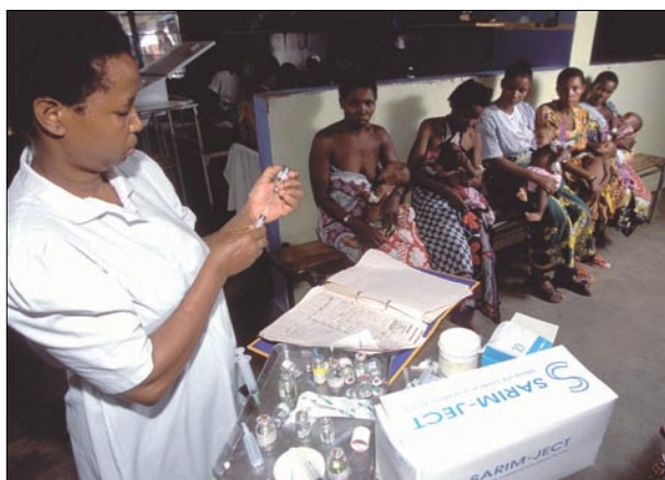
A nurse dispenses drugs to malaria patients in Kenya.

Strategies to remove or at least reduce demand side barriers, which disproportionately affect the poorest and most vulnerable in society, also need to be prioritised. Demand side barriers can include physical, financial, cultural and social barriers, such as opportunity costs, lack of knowledge about appropriate care, or distance to the health centre.